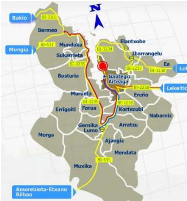
Map of the villages in Urdaibai Biosphere Reserve

The meeting will take place in the Urdaibai Bird Center. The Center was opened in 2011 and it is located in Gautegiz Arteaga, a small village located 40 minutes from Bilbao and 5 minutes from Gernika-Lumo by car. With a population of around 900 inhabitants, it is one of the 22 villages that form the Urdaibai Biosphere Reserve.